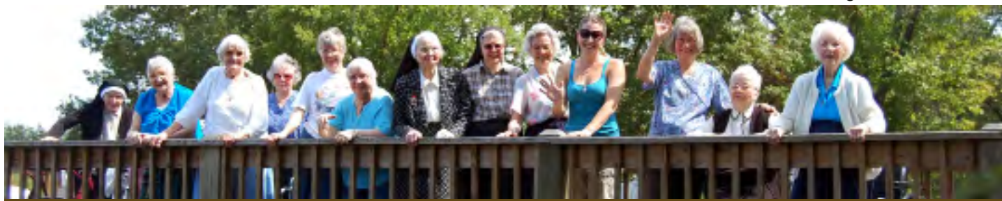
Sisters enjoy a field trip to Janet Huckabee Nature Center, September 22, 2010