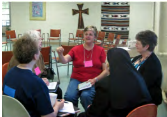
A small group discussion at the Retreat in Daily Life Retreat, Spring, 2010. Some Retreat in Daily Life participants choose to continue in the five-year Spiritual Director Formation program.