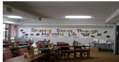
Stepping Stones Through Monastic Life The NATIONAL BENEDICTINE VOCATION CONFERENCE 2007